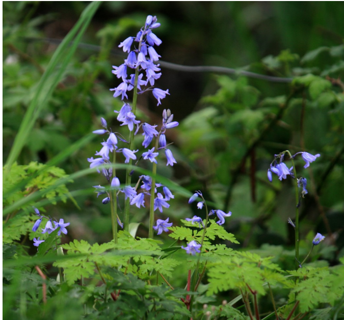
near Fennel Creek Headwaters

Bluebells are native perennials that thrive along wooded streams