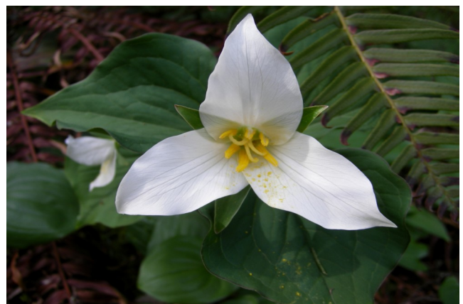
Fragile Trilliums prefer wooded and moist habitats