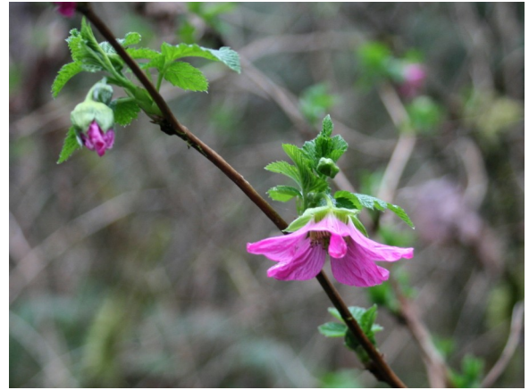
along Fennel Creek upstream of Victor Falls Salmonberry bloom and mushy fruit are both edible

Bluebells are native perennials that thrive along wooded streams